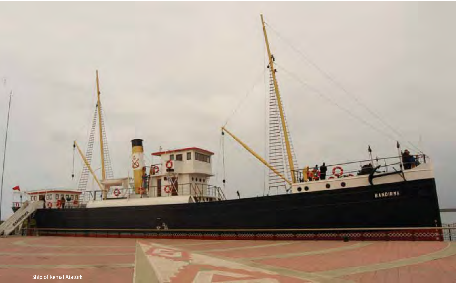
Ship of Kemal Atatürk

resistance. They listened to Mustafa Kemal eagerly. Everywhere he went he electrified the people to hope action. The